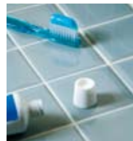
Just like with natural teeth, brush your new teeth carefully and floss as usual.