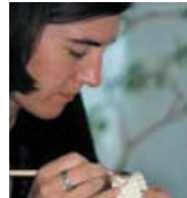
Craftsmanship at its best: the dental technician skillfully adapts the crown, bridge or prosthesis to every patient.